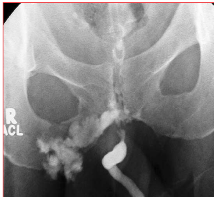
Figure 2. Retrograde Cystogram demonstrating complete urethral rupture

The investigation of choice is retrograde urethrography and is recommended in all where there exists a high degree of suspicion of urethral injury. Ideally performed under fluoroscopic surveillance a ballooned catheter is inserted into the distal urethral and the balloon filled in the fossa navicularis to occlude the urethra. Films are then obtained while injecting 20-30mls of water-soluble contrast. Extravasation of contrast without filling the bladder is diagnostic of a complete rupture while extravasation with bladder filling is indicative of a partial rupture 1 .